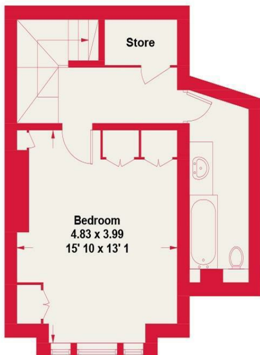
Lower Ground Floor 393 sq ft / 36.5 sq m